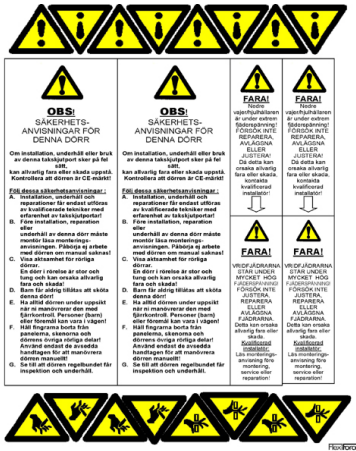
LABEL-GB etc Application on doors