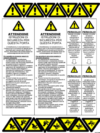
LABEL-GB etc Application on doors